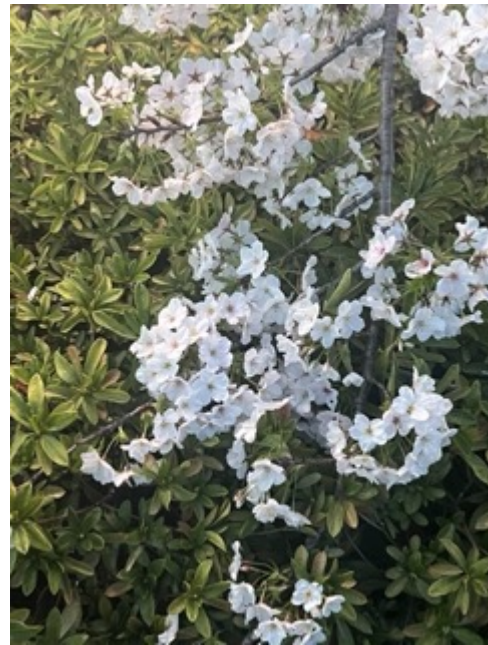
Senba Lake 湖