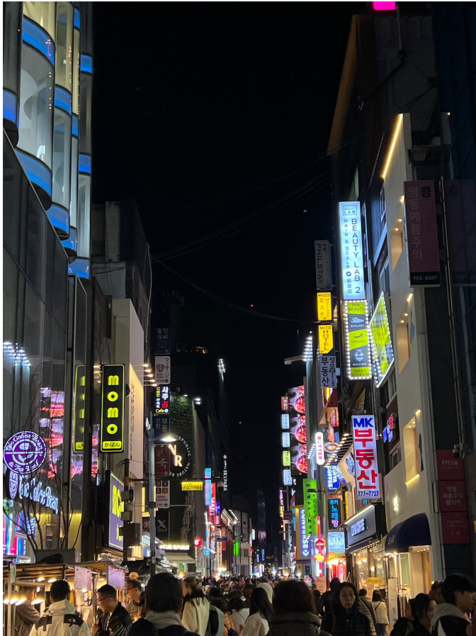
Myeongdong night market and a Hanok village near my hotel.