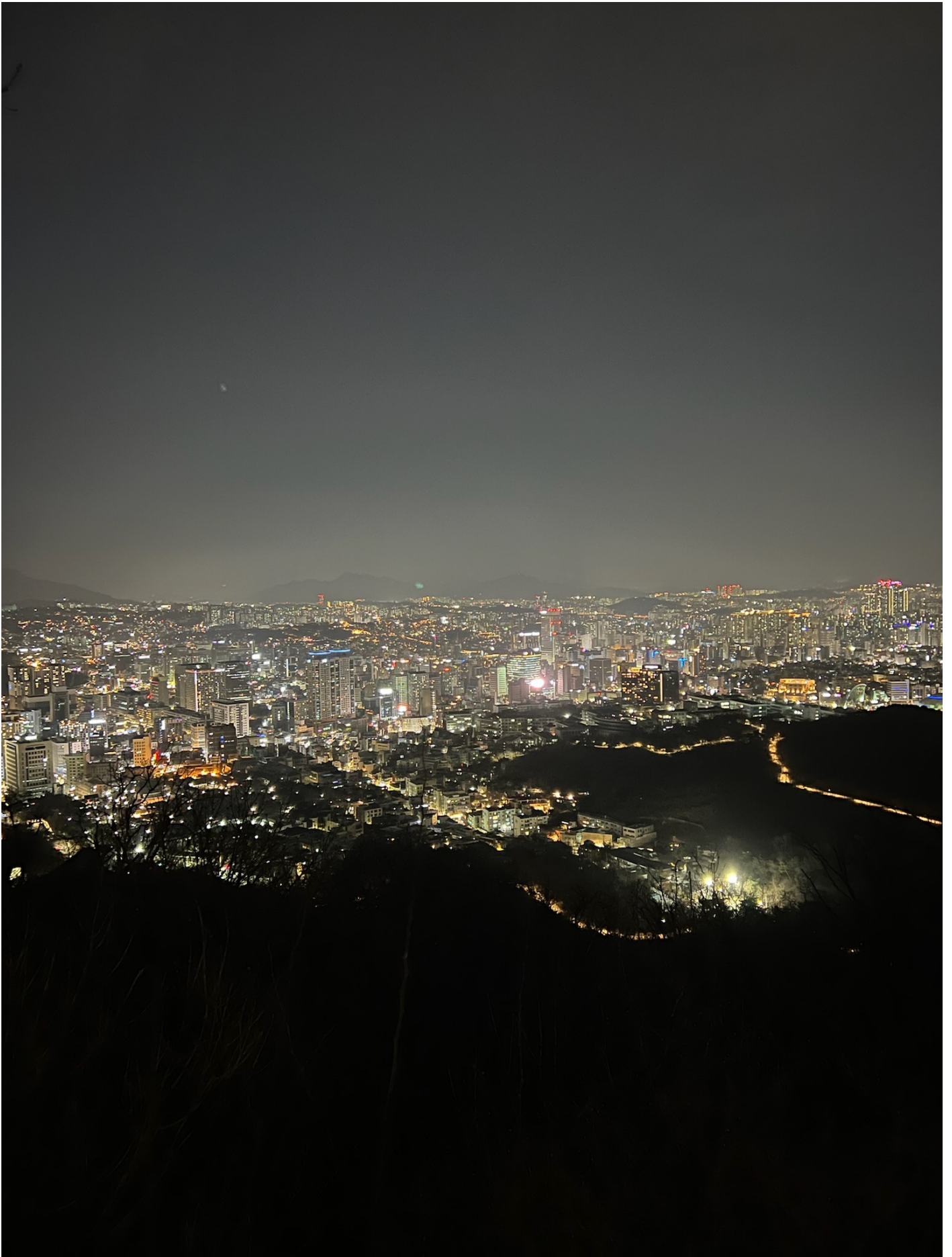
(Seoul Tower - night view)