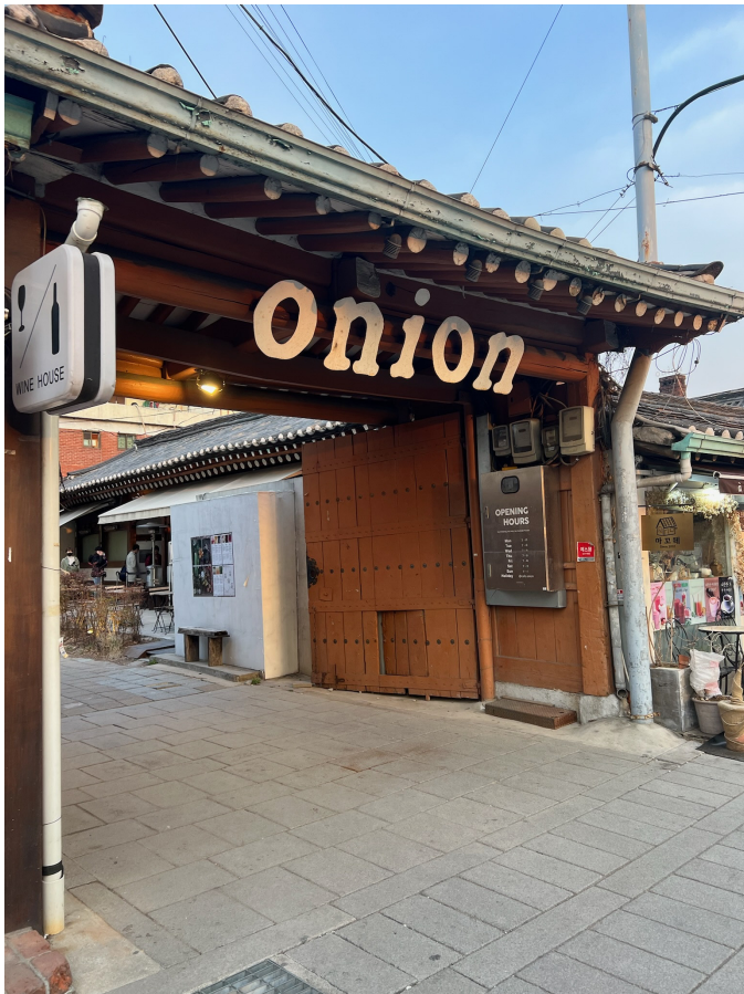
Cafe Onion Anguk