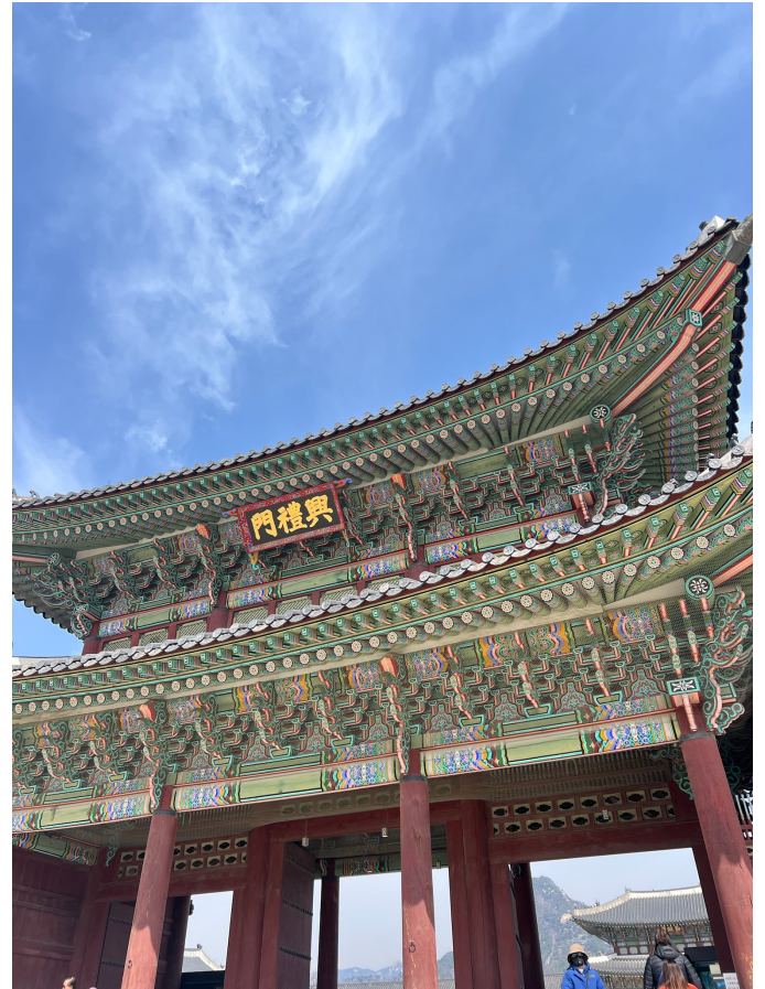
Bukchon Hanok Village and Gyeongbok Palace