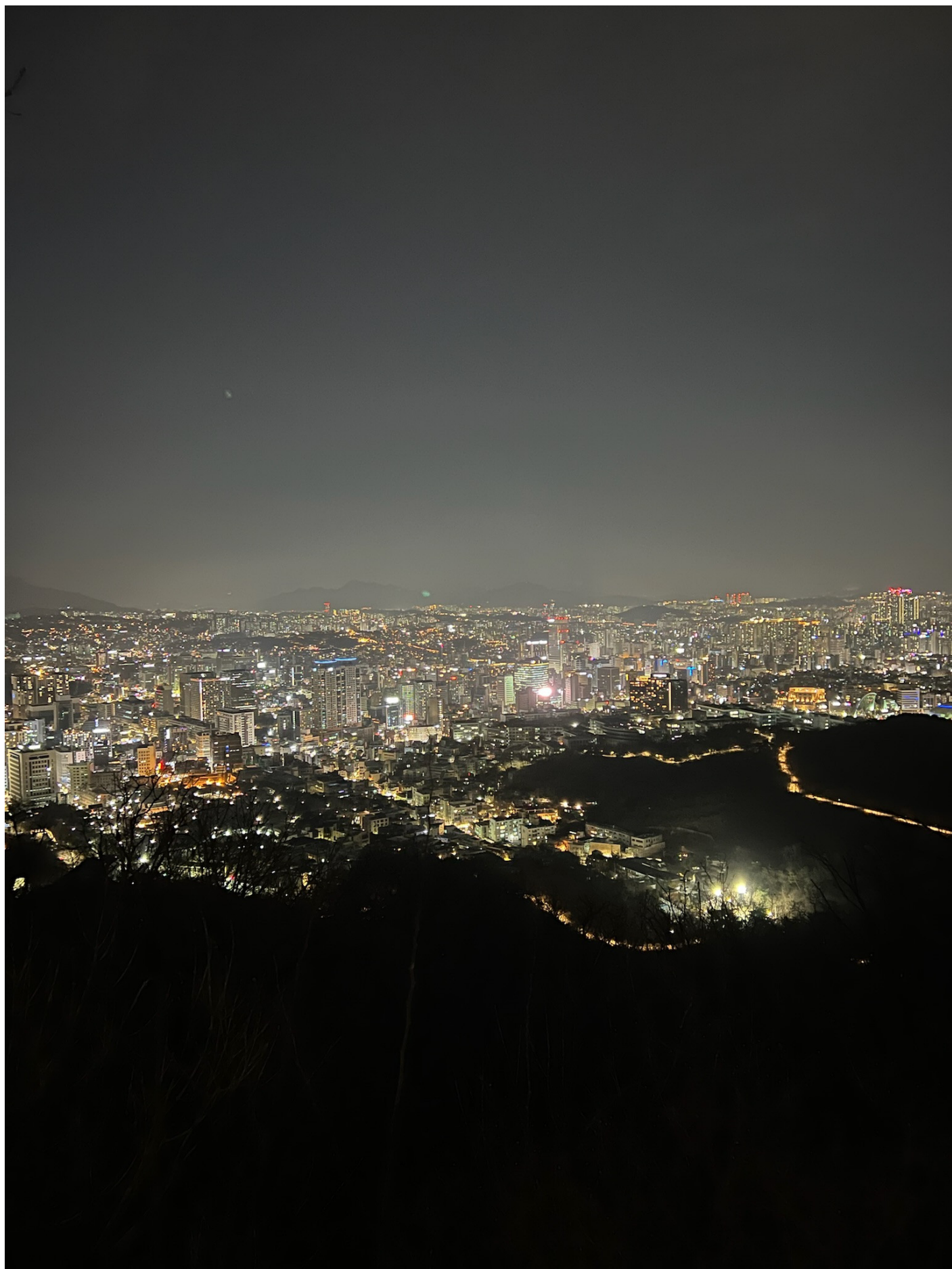
(Seoul Tower - night view)