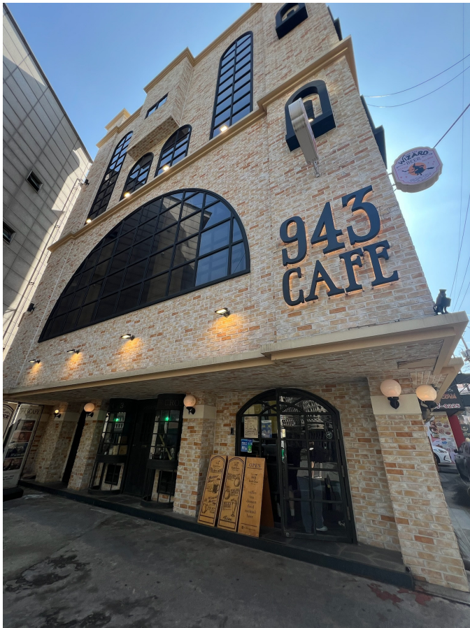
Harry Potter Cafe