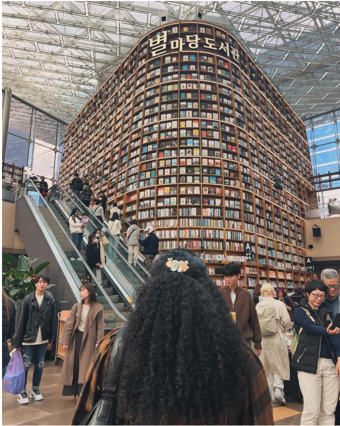
Byeolmadang Library in Starfield COEX Mall