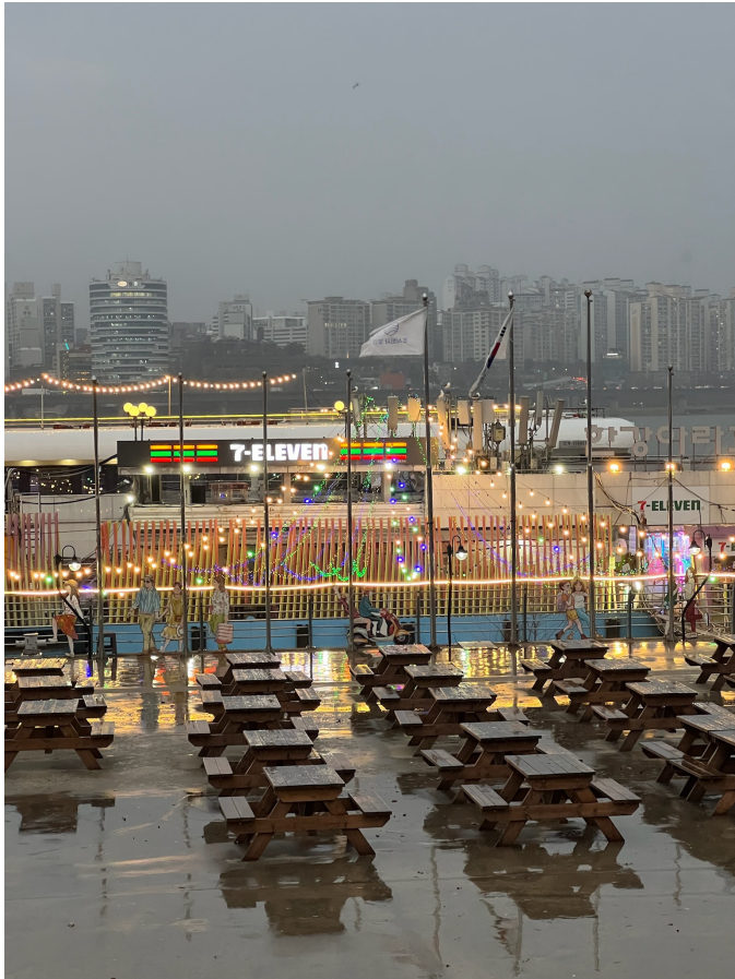
The floating 7/11 by the Han River.