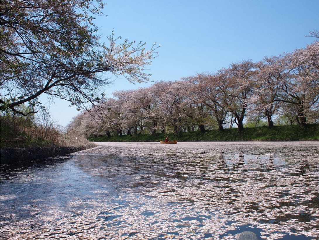
Fukuokazeki Sakura Park in Tsukubamirai

Hello everyone and happy March! We are already 3 months into 2024. The months are going by quickly and soon we will be back in the summer heat. However, right now, we are entering Sakura Season! Sakura Season is one of my favorite things about living in Japan.